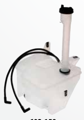
603-159 Ford Explorer 2010-02, Lincoln Aviator 2005-03, Mercury Mountaineer 2010-02